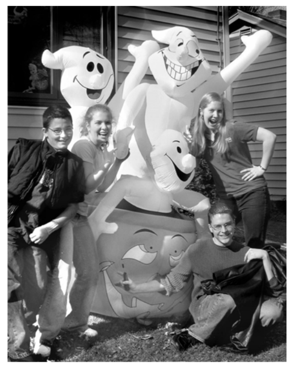
Cultural exchange opportunities are abundant in Vitamin L — here some of the Hamilton concert crew cavort with denizens of downtown DeRuyter.